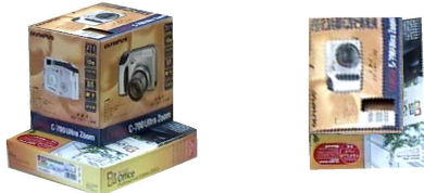
Figure 2: The 3-D shape reconstructed from the video sequence of Fig. 1(b).

methods. We stopped the iterations of the outer cycle when the reprojection error is 0.1 pixels. We used Pentium 4 3.4GHz for the CPU with 2GB main memory and Linux for the OS. The “efficiency index” means the ratio of the longer computation time of the prototypes to the shortest of all.